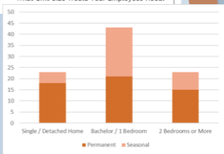
What Unit Size Would Your Employees Need?

From our survey results the most in-demand living accommodation for both permanent and seasonal employees is Bachelor / 1 Bedroom units